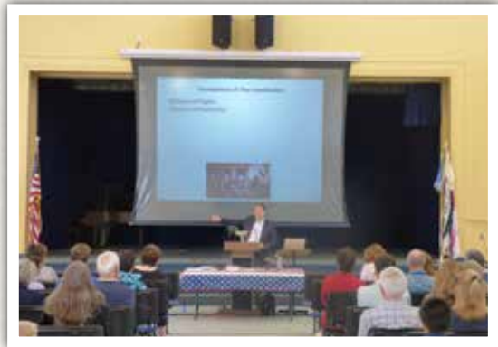
(Vista Granda Elementary School in Danville)