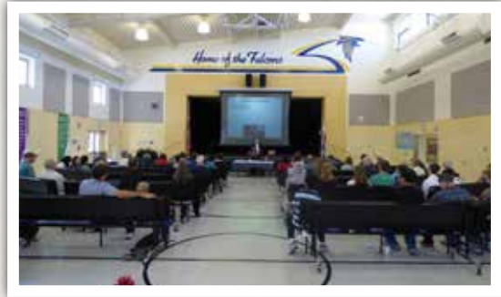
(Vista Granda Elementary School in Danville)

This year IPS was able to host two Constitution Under Siege seminars (thanks to two IPS Foundation Builders Committees). The first seminar was held on Saturday, September 17th (Constitution Day) in Fresno at the California Baptist Foundation. The second seminar took place on Saturday, October 1 st in Danville inside Vista Grande Elementary School's gymnasium.