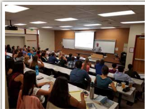
(IPS Debate Workshop in Santa Clara)