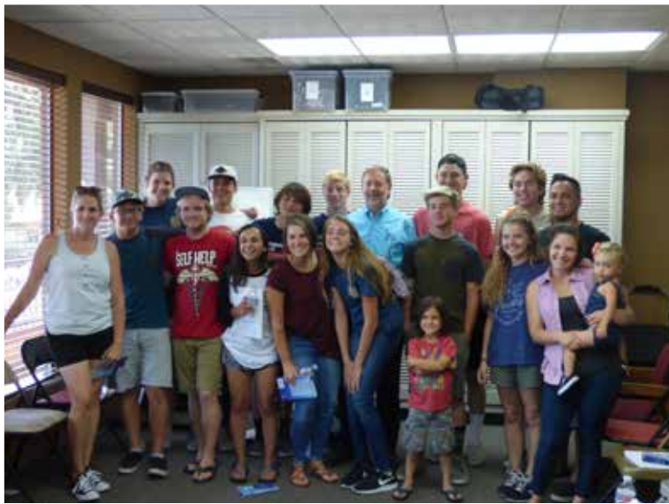
(Youth group from Grace Fellowship Church at the IPS office)