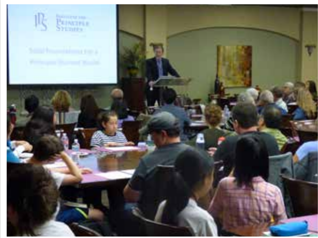
(The Home Church in Campbell)

This year, the class was held at Monte Vista Chapel in Turlock and the Home Church in Campbell. This was the first time the class made its way to Turlock, and 185 people registered to attend. In Campbell, 130 individuals elected to take the class. In total, since 2005, there have been 3,354 people throughout California that have taken this course. That’s an average of 140 people per class!