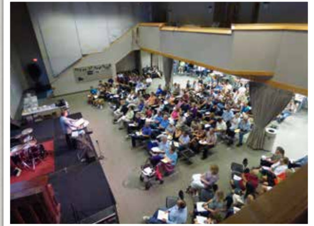
(Monte Vista Chapel in Turlock)

The core educational outreach of this program will expand exponentially next year with the highly anticipated release of the class on DVD. Projecting a release date in early 2017, copies of the DVD series will be available for purchase through the IPS website. If you want to make sure you are notified about the finalized DVDs, simply call or email the IPS office and let us know you’re interested. You can also help promote the DVD series by contacting the office to acquire graphics and posters to be used in promotion.