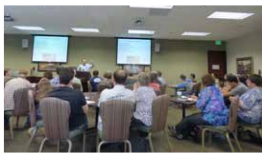
(California Baptist Foundation in Fresno)

Sixty-five people in Fresno and seventy people in Danville learned about the Constitution's foundations and how specific clauses apply to government issues. Many were surprised to learn that clauses like the “general welfare clause,” the “interstate commerce clause,” and the “necessary and proper clause” (which are often used to expand government control and power) actually limit federal government power and jurisdiction! Students from nearby schools even earned extra credit for attending. These were two Saturdays well spent learning how our founders framed the Constitution and their purpose in designing it. A seminar participant in Fresno truly captured the importance of this information in their following comment: