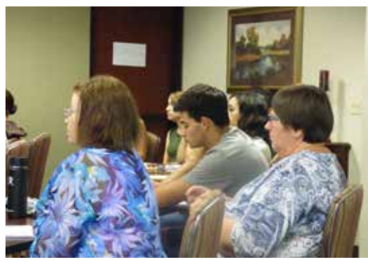
(California Baptist Foundation in Fresno)